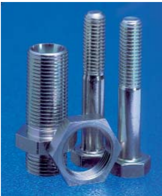
Excellent corrosion performance for mass articles with ClearProtect Extreme

The sealer can be used for ClearProtect and BlackProtect finishes.