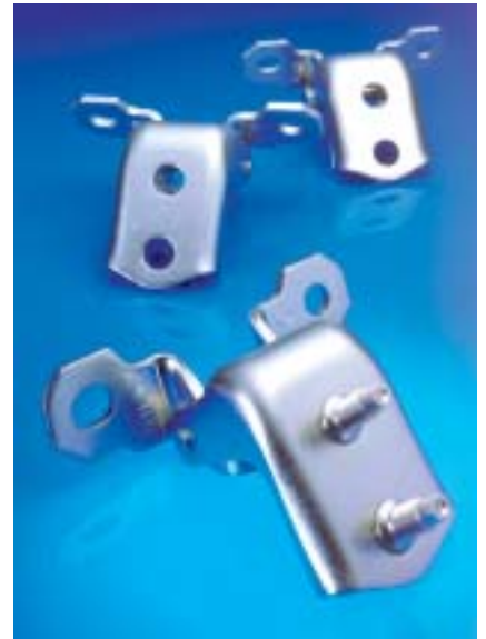
Clear color and outstanding corrosion resistance with ClearProtect

EcoTri is a passivate process used to produce a thick layer iridescent passivate coating perfectly compatible with Atotech zinc and zinc alloy plating processes. It is completely free of hexavalent chromium and fluoride. By using a higher trivalent chromium concentration in an optimized bath formulation and high operation temperature, a conversion coating of a layer thickness (0.3 µm estimated) comparable to a conventional yellow chromate can be produced. The corrosion resistance is significantly better compared to conventional blue passivates. After heat treatment the performance of EcoTri even exceeds that of a conventional yellow chromate coating. For highest corrosion performance especially after heat treatment EcoTri HC is the preferred product. Recirculation of the rinse water is recommended in order to reduce the consumption and the use of an ion exchanger system will ensure a very long bath life with consistent performance.