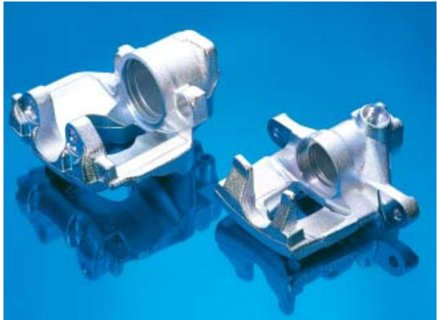
ClearProtect Extreme 401 provides best performance for brake calipers

ClearProtect Extreme is a combination of EcoTri with Corrosil CFS-R (Plus 501). It is perfectly compatible with Atotech zinc and zinc alloy plating processes. When using ClearProtect Extreme for barrel application, the work should be transferred from the plating barrel into passivating baskets.